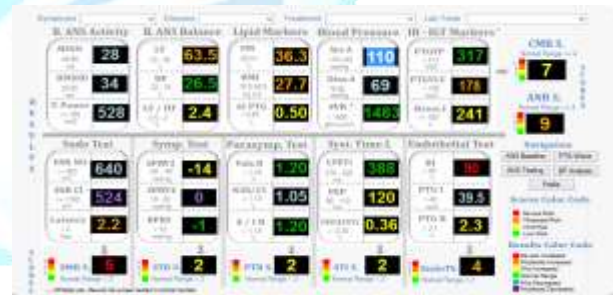
Figure 3: Biomarkers for Cardiometabolic Diseases. (Courtesy: Dr Albert Maarek).

The manufacturers describe these systems as SudoPath system, TM Oxi system, and ES Complex system. Together, this platform performs several tests, to detect early stages of peripheral autonomic neuropathy, dysfunction of microcirculation, diabetic autonomic neuropathy, endothelial dysfunction, diabetes management, and detection of diabetes-related clinical complications (Figure 3). There is a great need for the development of noninvasive diagnostic platform, for the early detection of risks for the development of metabolic diseases. We are currently working on a project, in which we would like to use the advances made in the flexible piezoelectric pressure sensors.