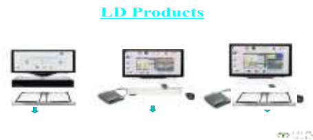
Figure 2: Non-invasive diagnostic tools for assessing CMD risks.

Such emerging technologies, empower the patient not only to monitor glucose profiles, but also allows them to follow the effect of diet, physical activity, and lifestyle changes on the glucose levels. We have seen in recent years, development of number of non-invasive diagnostic tools, activity trackers, and health apps. We are validating some of these emerging technologies, in our effort to develop a comprehensive diagnostic platform for risk assessment, risk stratification, and risk prediction. Shown in the (Figure 2) are some of the LD-Technology (www.ldteck.com) products, used for assessment of cardiometabolic risks. This non-invasive diagnostic platform uses just three FDA (US Food and Drug Administration) approved devices, oximeter, blood pressure monitor, and galvanic skin response monitor [25].