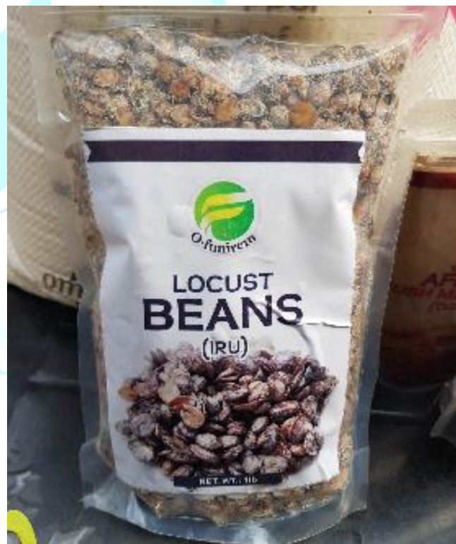
Figure 1: Ready to eat packaged locust bean.